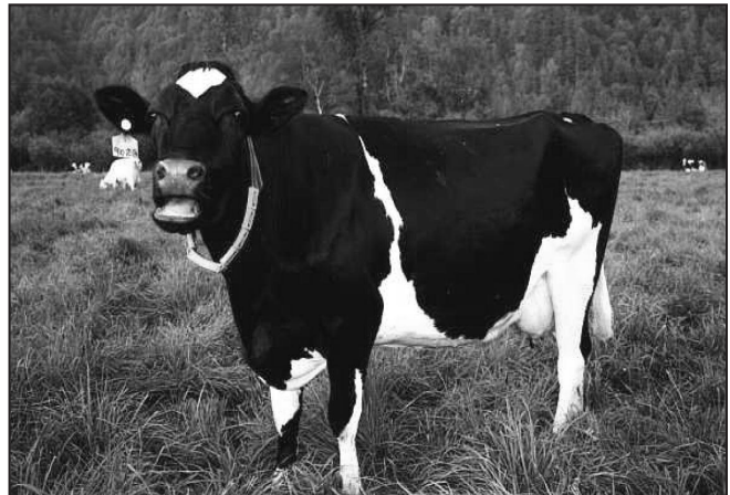
Figure 1. Cows on pasture at the UBC Dairy Centre. This study asked if lame cows benefit from access to pasture.

Freestall housed cows were kept in pens that had six metres of accessible alley space and one stall per cow filled with 40 cm of washed river sand. Cross-over alleys were scraped daily and all other alleys were cleaned six times daily. All flooring outside the stall area was concrete.